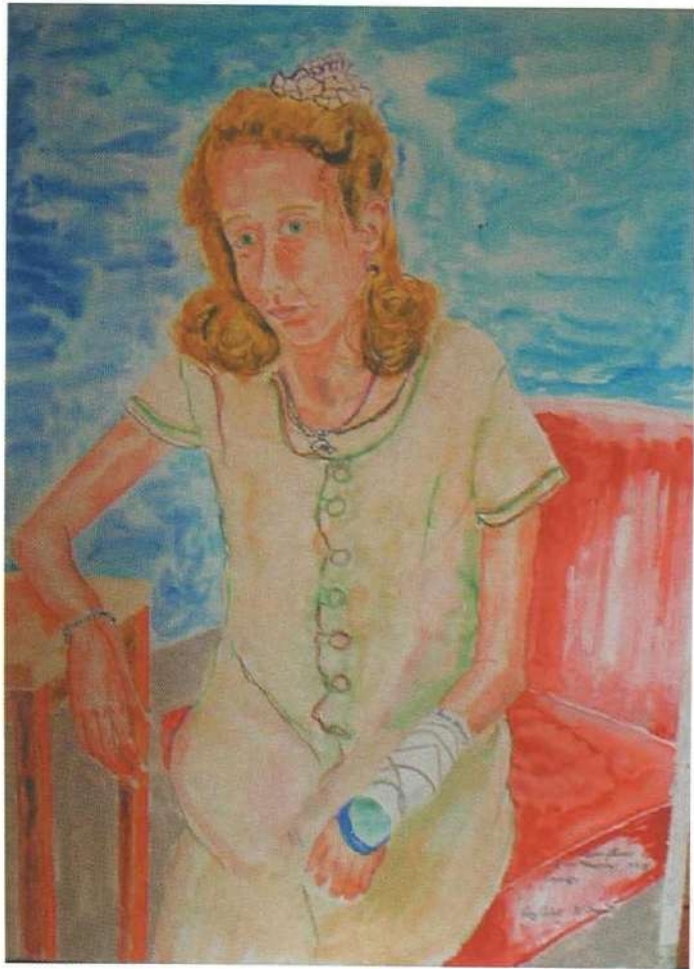
SIR ROY CALNE > 14