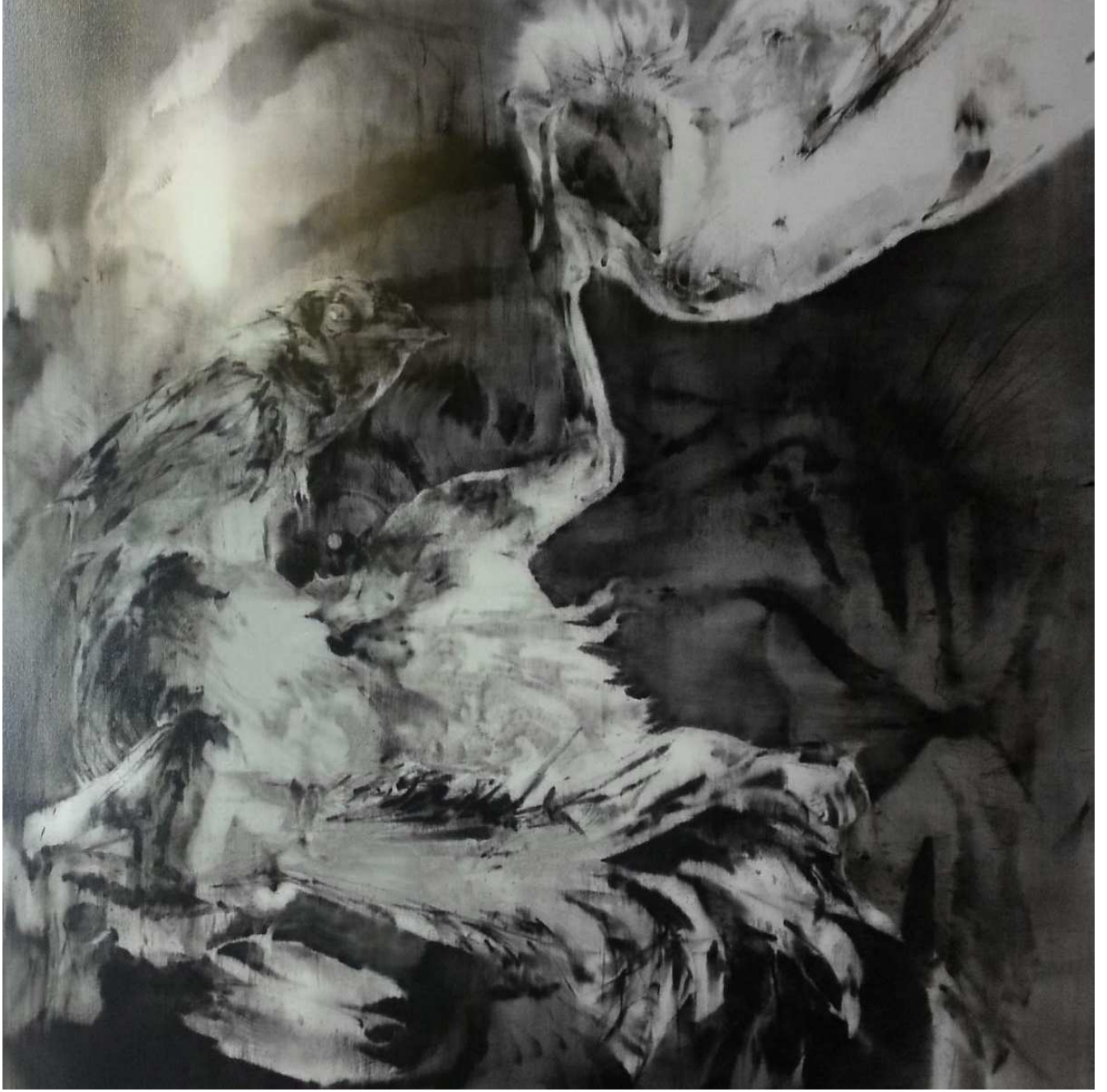
For the piece of pie, 2014 Oil on jute, 183 x 183 cm