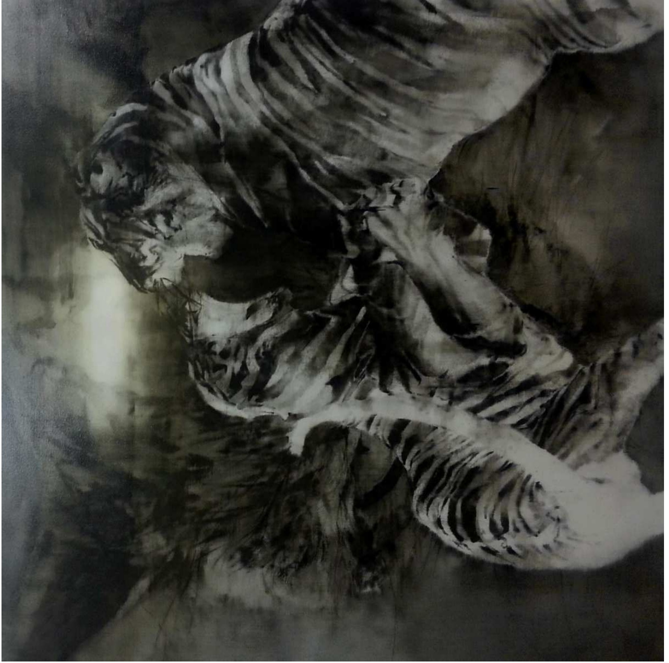
We are family, 2014 Oil on jute, 183 x 183 cm