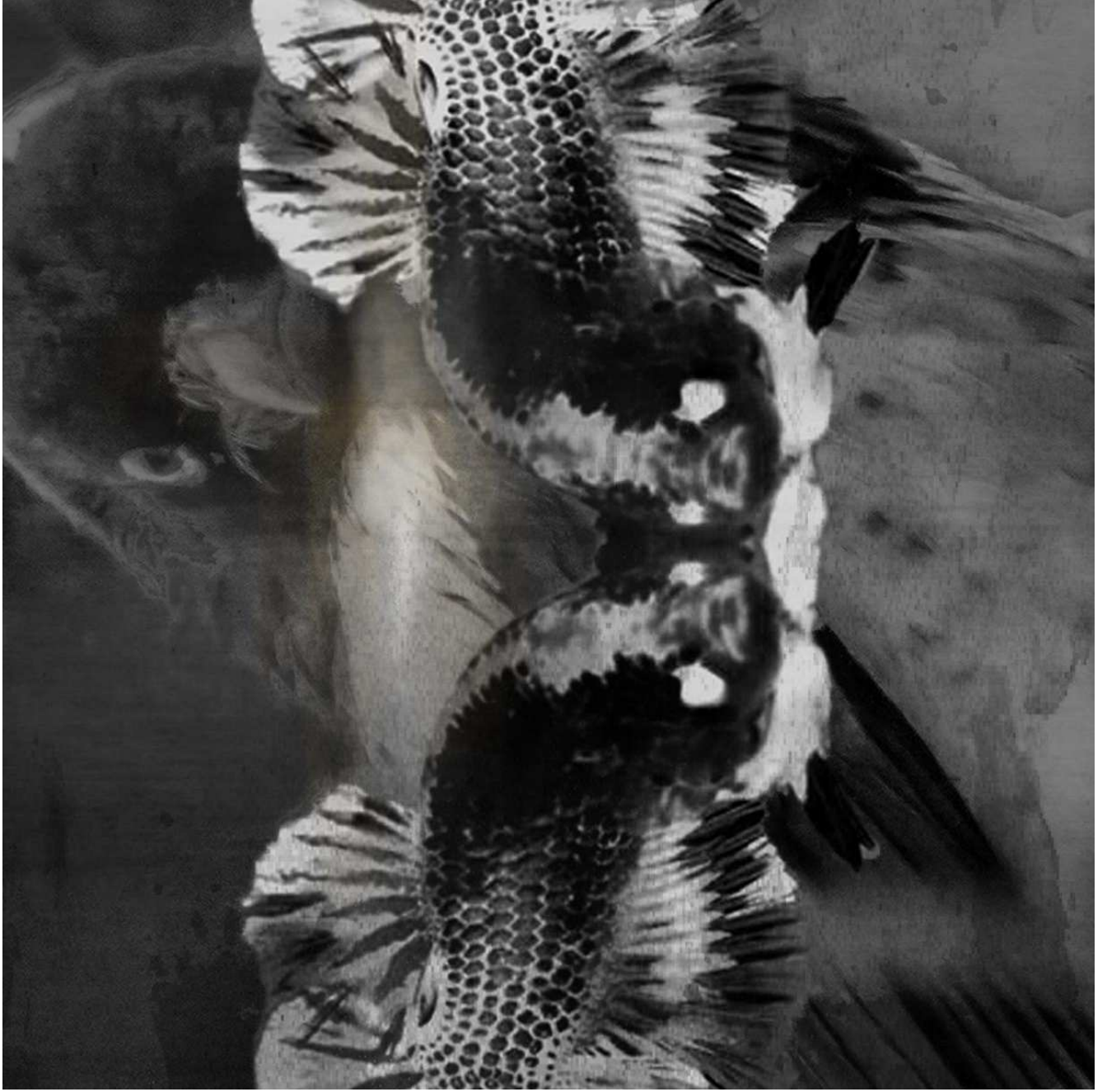
Mirror mirror on the wall, 2014 Oil on jute, 90 x 90 cm