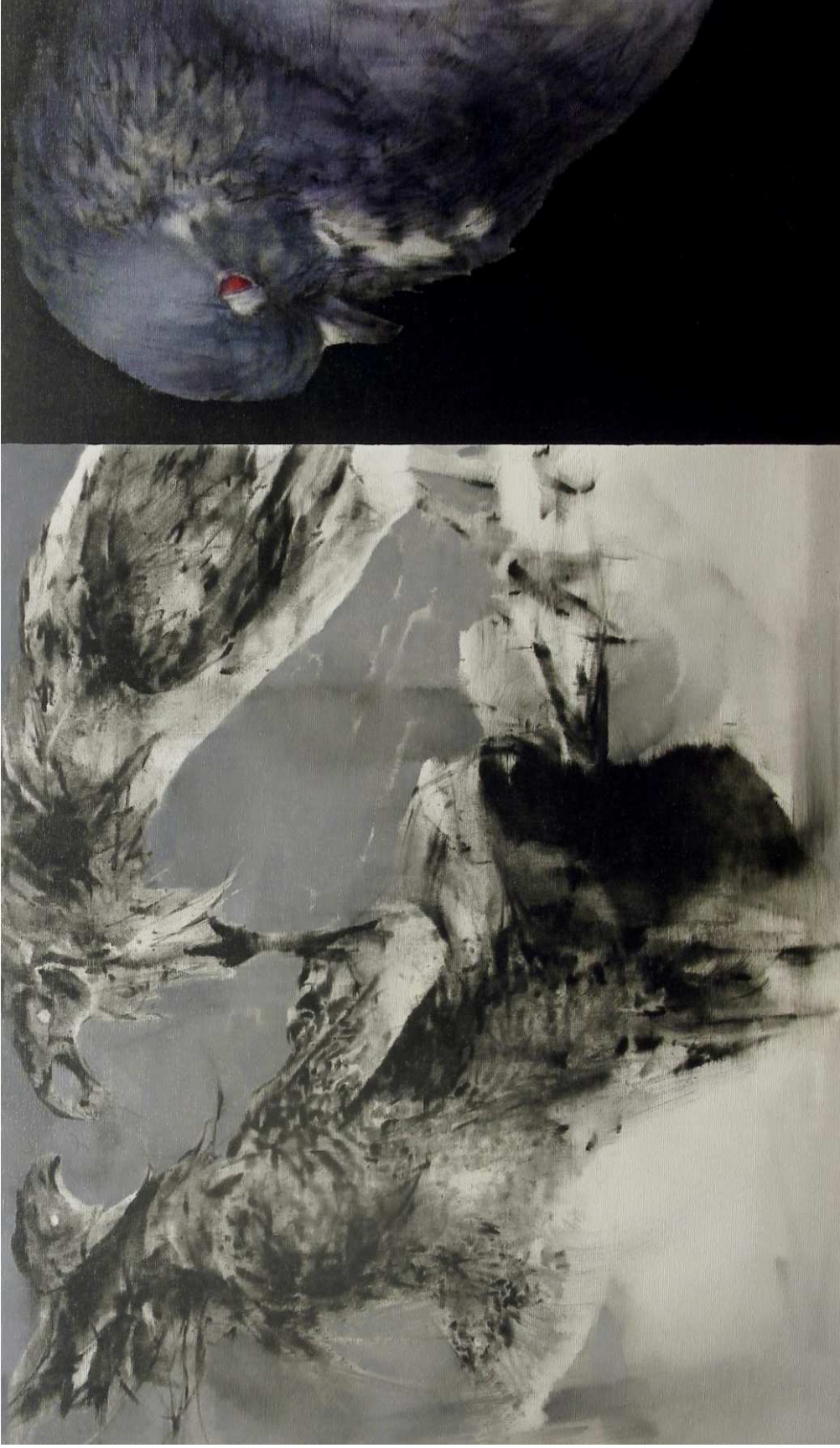
Peace maker, 2014 Oil on jute, 90 x 150 cm