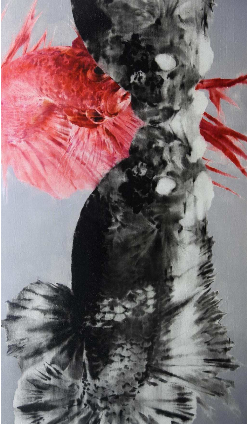
Who's the fairest of them all, 2014 Oil on jute, 90 x 150 cm