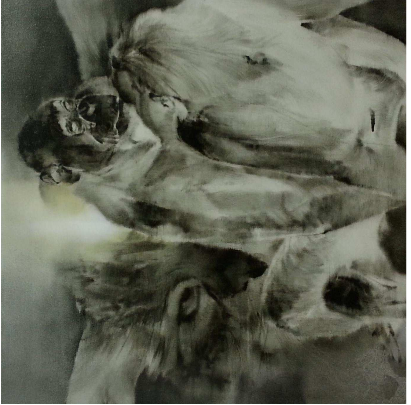
Monkey business , 2014 Oil on jute, 90 x 90 cm