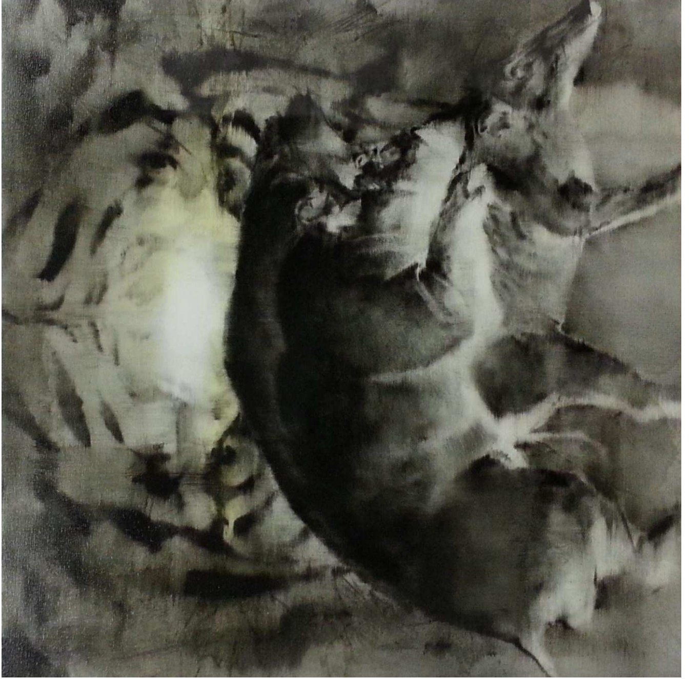
Law of the jungle , 2014 Oil on jute, 90 x 90 cm