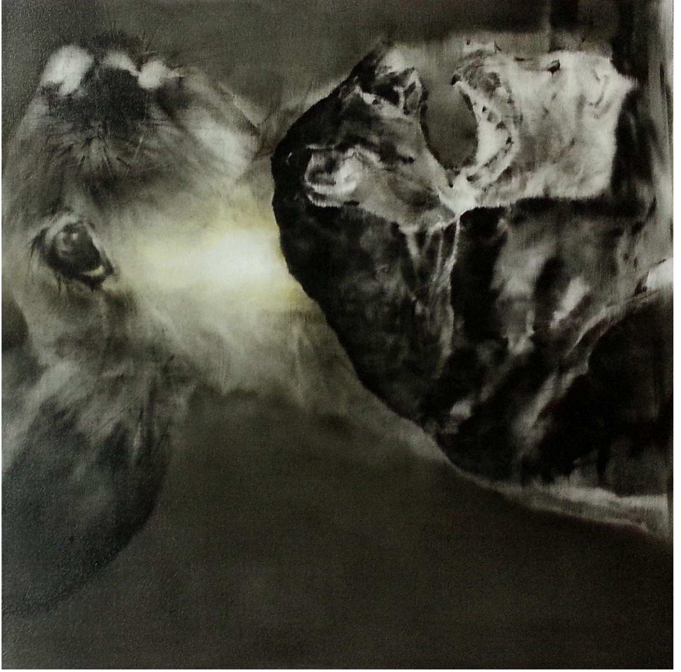
Fearsome , 2014 Oil on jute, 90 x 90 cm